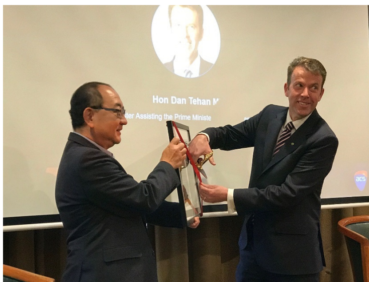
ACS Cyber Specialisation Ribbon Cutting.