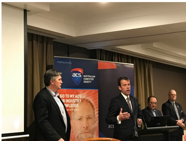
Hon Dan Tehan Minister Assisting the Prime Minister for Cyber Security presenting at launch of ACS Cyber specialisation.